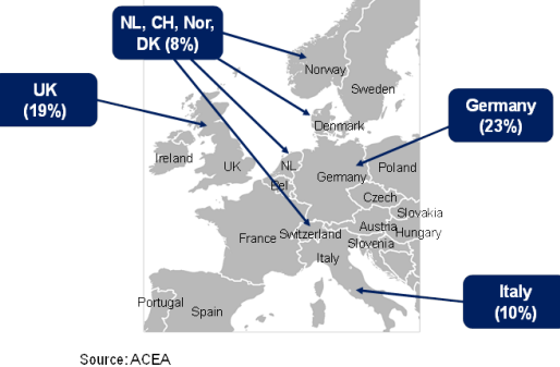
Figure 1 % share of European new car sales 2014 – markets with DAB / DAB+