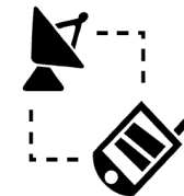
MONITORING EQUIPMENT MANUFACTURERS