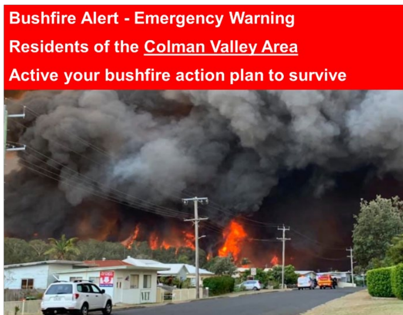
Figure 4: An example image for a bushfire alert