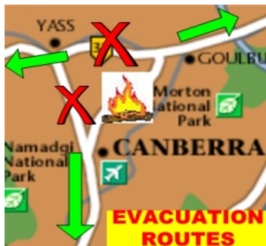
Figure 2: Example map image showing bushfire affected areas and escape routes

While verbal warnings are the backbone of emergency warning communications, the increasing availability of radio receivers with multimedia capabilities and colour screens allows the display of images such as maps of affected areas and critical information such as the location of shelters or supplies, as shown in the example image in Figure 2. This feature is supported by the growing number of car models which include DAB+ as standard.