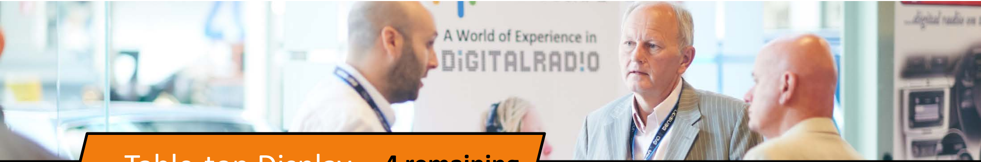
Table-top Display 4 remaining