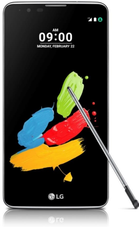
LG Stylus DAB+