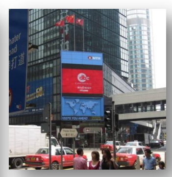
World Wide House, Central