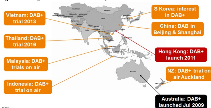
Figure 2: Digital radio in Asia Pacific

In Asia Pacific, a similar pattern is emerging. Australia successfully launched DAB+ in 2009, followed by Hong Kong in 2011. Several other markets, including Thailand, Malaysia, Indonesia and Vietnam are now investigating digital radio options. WorldDAB has organised workshops in each of these countries.